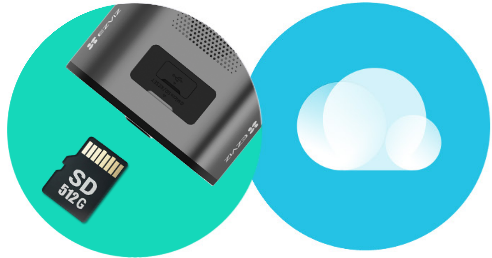
Supports MicroSD Card

Even huge video files and detection clips in a busy day can be properly and safely stored without a problem. You can use a large microSD card to keep everything locally without any commitment to a monthly plan. Or, simply enjoy the services provided by the EZVIZ CloudPlay 5 for less hassles.