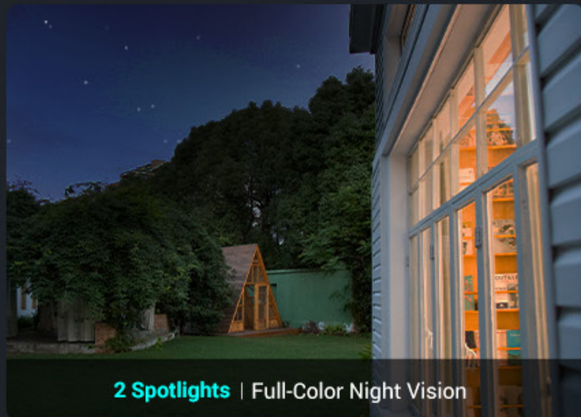
2 Spotlights | Full-Color Night Vision