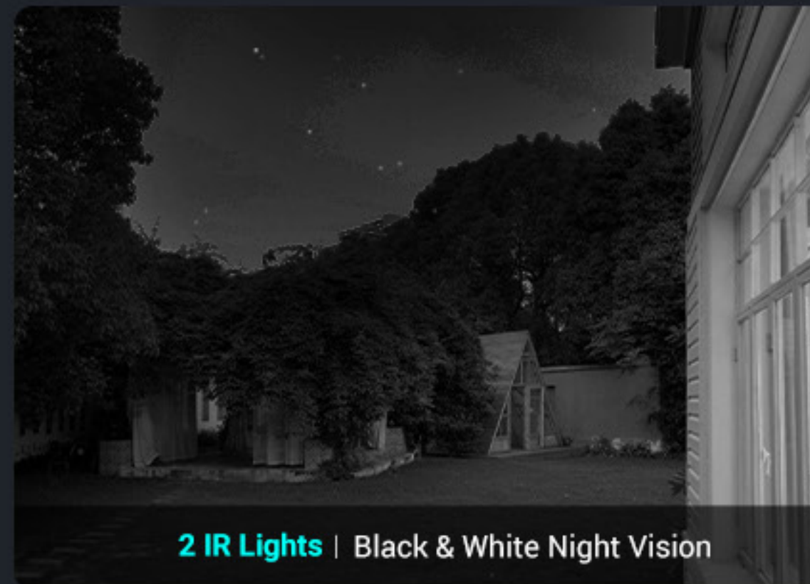
2 IR Lights | Black & White Night Vision